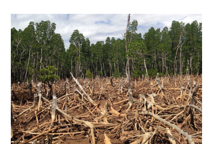
Third Party Timber