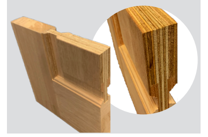
11 Ply Panel Construction