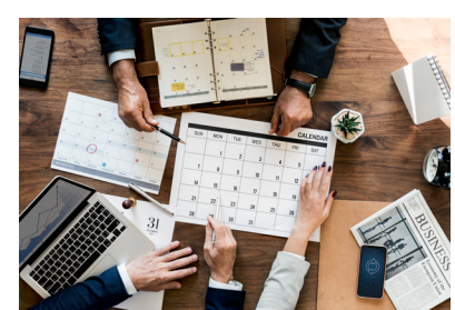
Long Leads and Waits