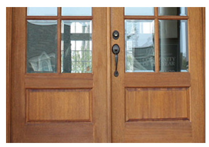
Vertically Grained Panels