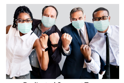
Dedicated Support Team