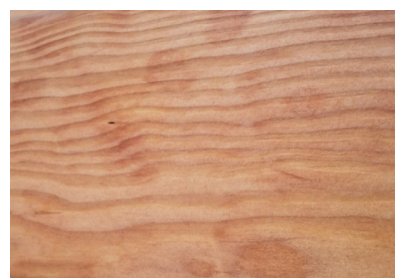
Uneven Stain Absorption