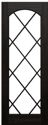
Valencia Diamond Lite