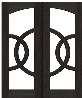
Valencia Halo Lite