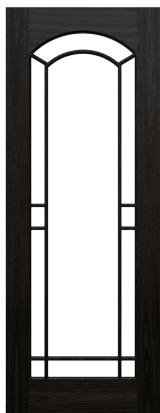
Valencia Prarie Lite