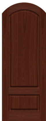
Lucie Solid Panel